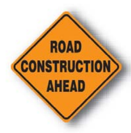
Road Construction Watch for bumpy roads and large equipment.